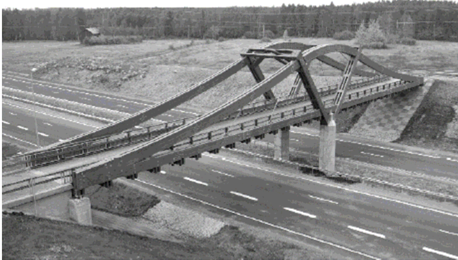
Illustration 7: Haikula Wood Bridge finish