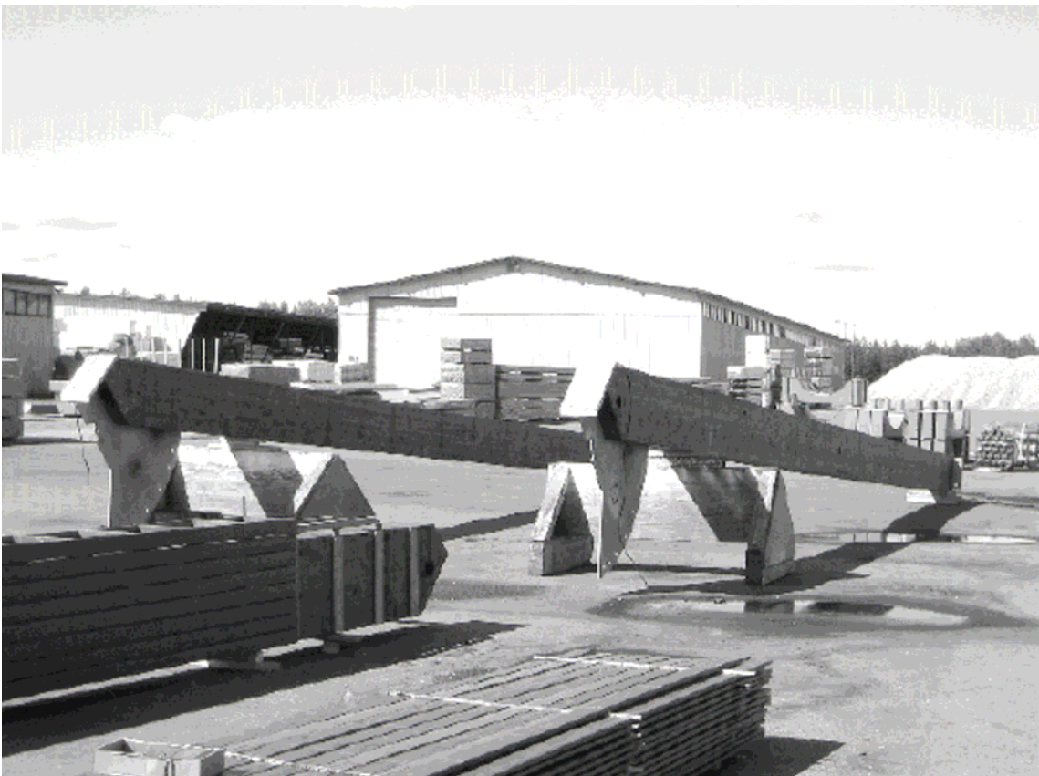
Illustration 3: Factory