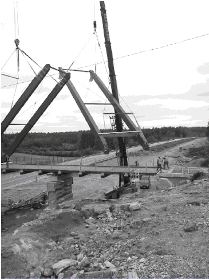
Illustration 5: Construction