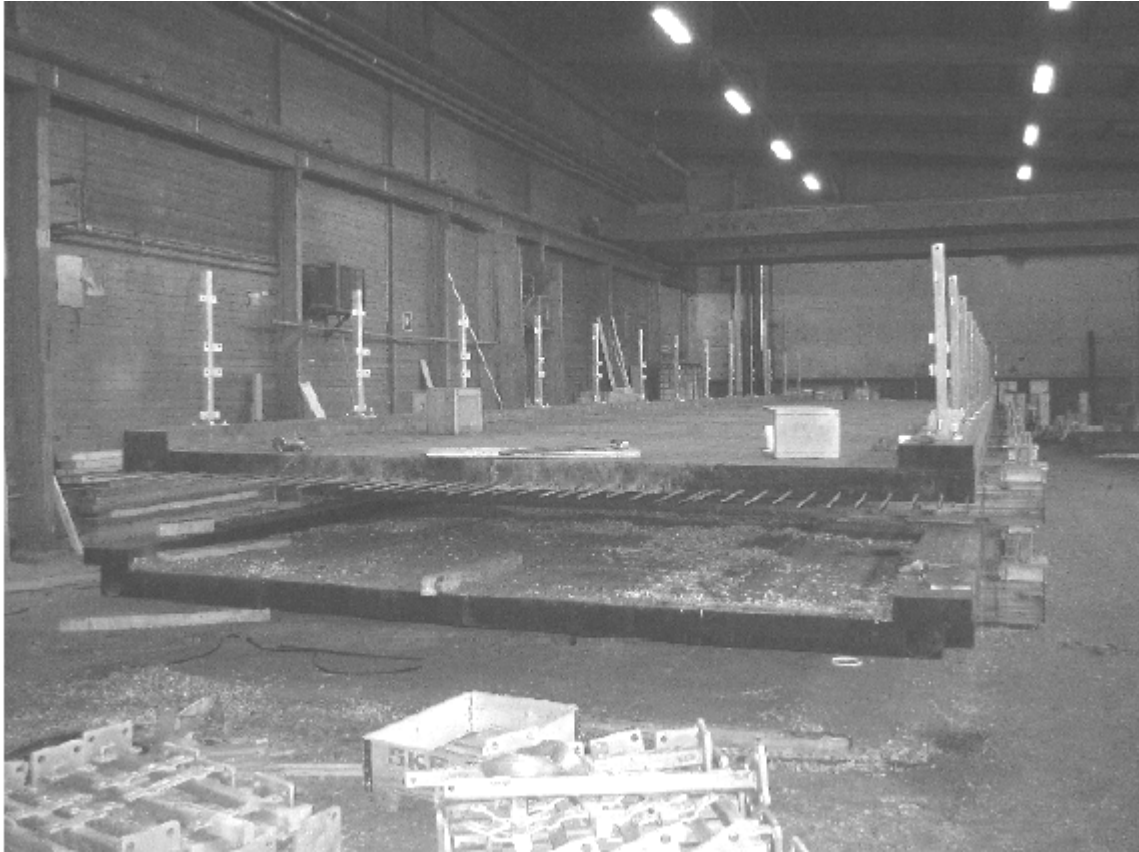
Illustration 2: Assembly of elements