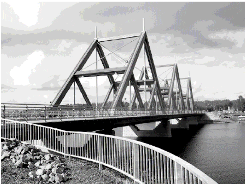
Illustration 6: Panorama of the Wood Bridge