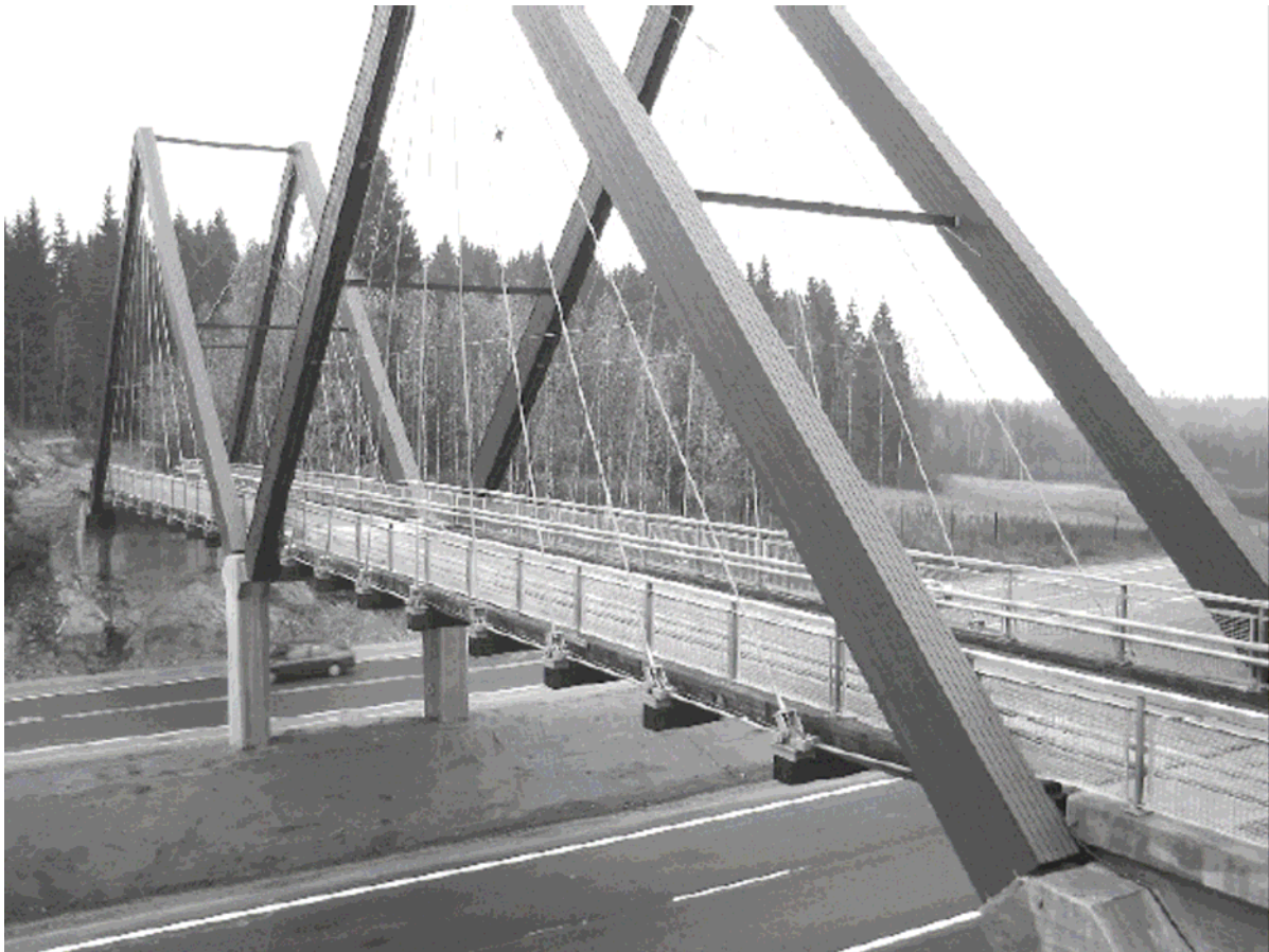
Illustration 1: Haikula Bridge

Versowood Oy supplied a wooden bridge that crosses over the motorway just before the Vierumäki junction. Although there are several concrete bridges crossing the way, the Haikula wood bridge, as it is, is a symbol of high wood construction technology, a real landmark. The Finnish Road Enterprise, a domestic organization that is responsible of the road net, construction and maintenance, was the main contractor. Consultants, who were designing the motorway as a whole, the bridge included, had originally proposed a wooden bridge. The bridge design was opened to competition between several architects, designers and students, from whom Versowood was chosen as the partner on the grounds of experience and comprehensive service. The bridge was to be a double truss framed bridge, the design being somewhat similar to a bridge built about five years ago, 50 km north from Haikula.