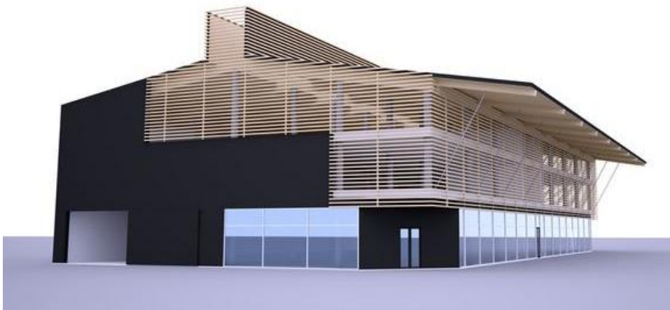
Abbildung 2: Sweden's first multi-storey car park Skellefteå