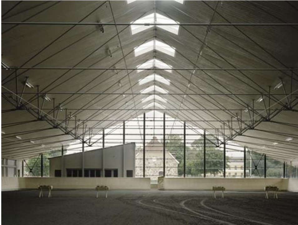
Abbildung 5: House for horse riding at Flyinge