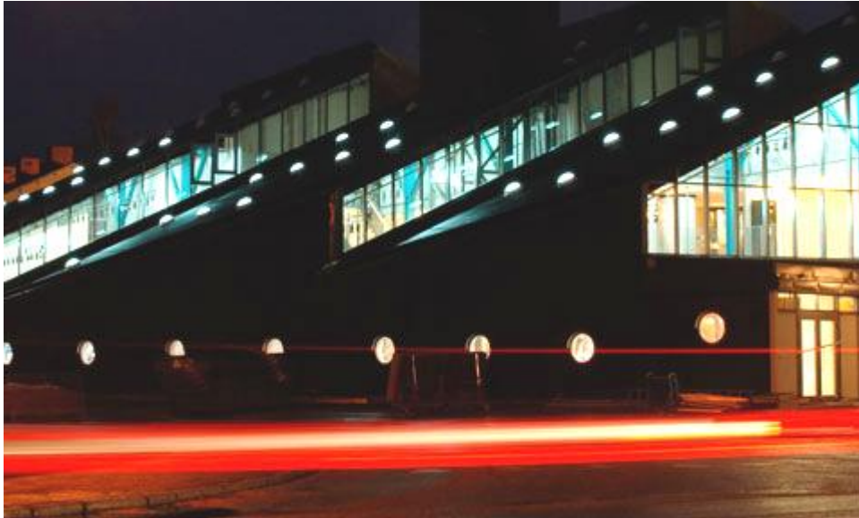
Abbildung 3: House of design in Hellefors