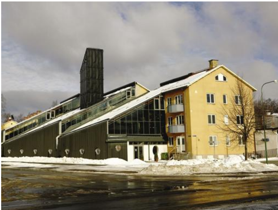
Abbildung 4: House of design in Hellefors