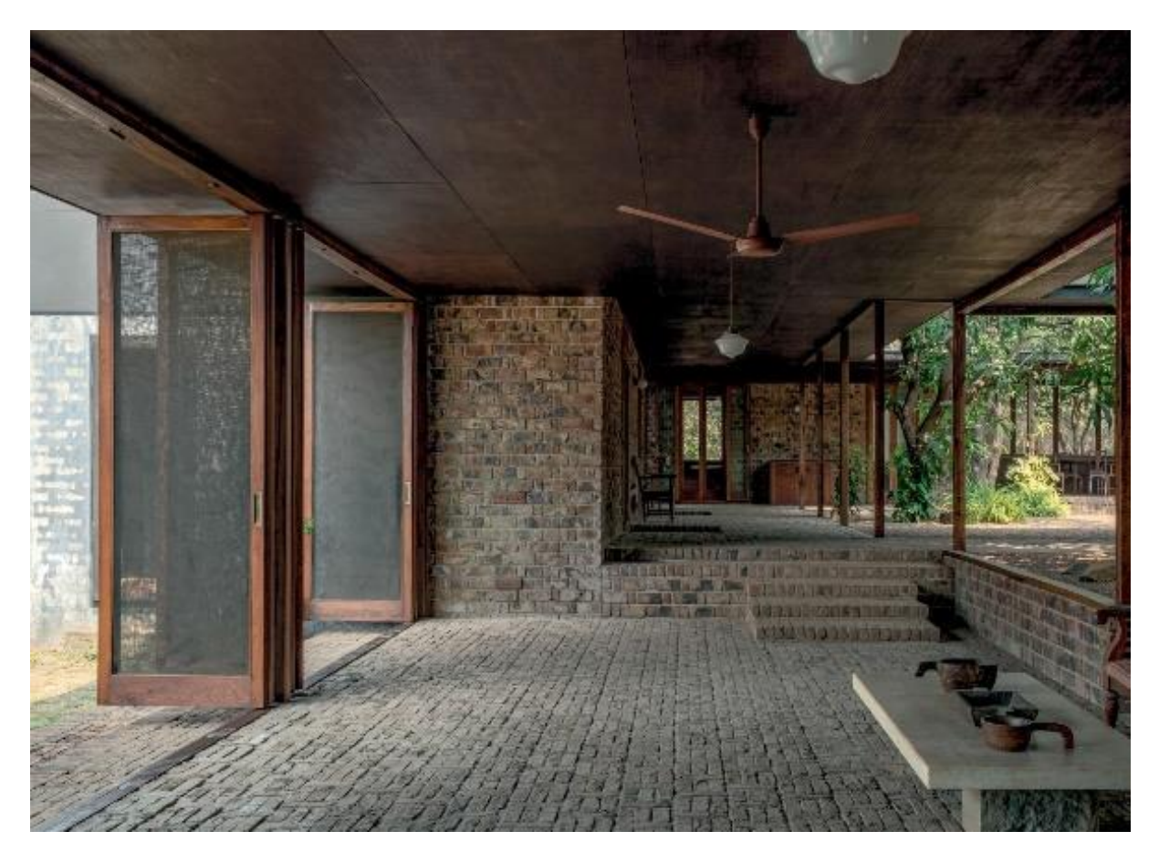
Figure 5: House of Nine Rooms