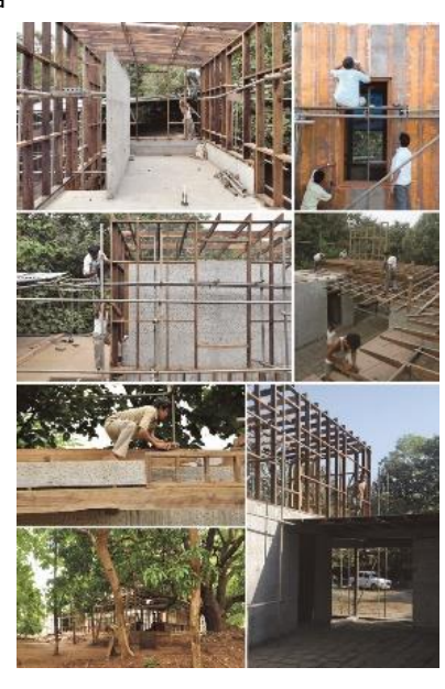
Figure 4: Copper House II