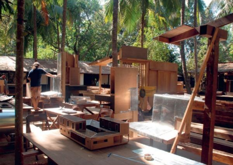
Figure 2: Studio Mumbai_Saat Rasta